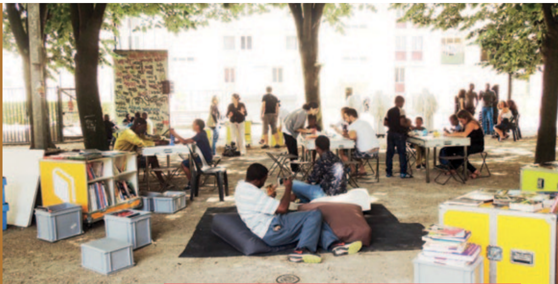
Libraries without Borders / Ideas Box

Created in 2007, Libraries Without Borders's mission (LWB), in both development and humanitarian contexts, is to provide access to information and culture for all by providing support to libraries worldwide. Since 2012, LWB has been developing digital content projects in both educational sectors (MOOC, collaborative learning, etc.) and professional fields (specialized digital libraries, etc.). LWB has supported more than 300 libraries throughout the world since its creation.