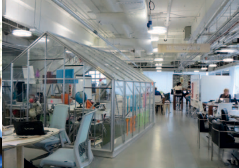
Aalto University &amp; MIT / School as a Service