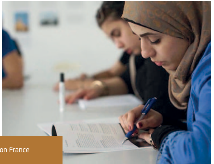
Kiron Open Higher Education France