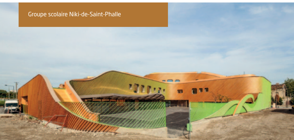
Groupe scolaire Niki-de-Saint-Phalle